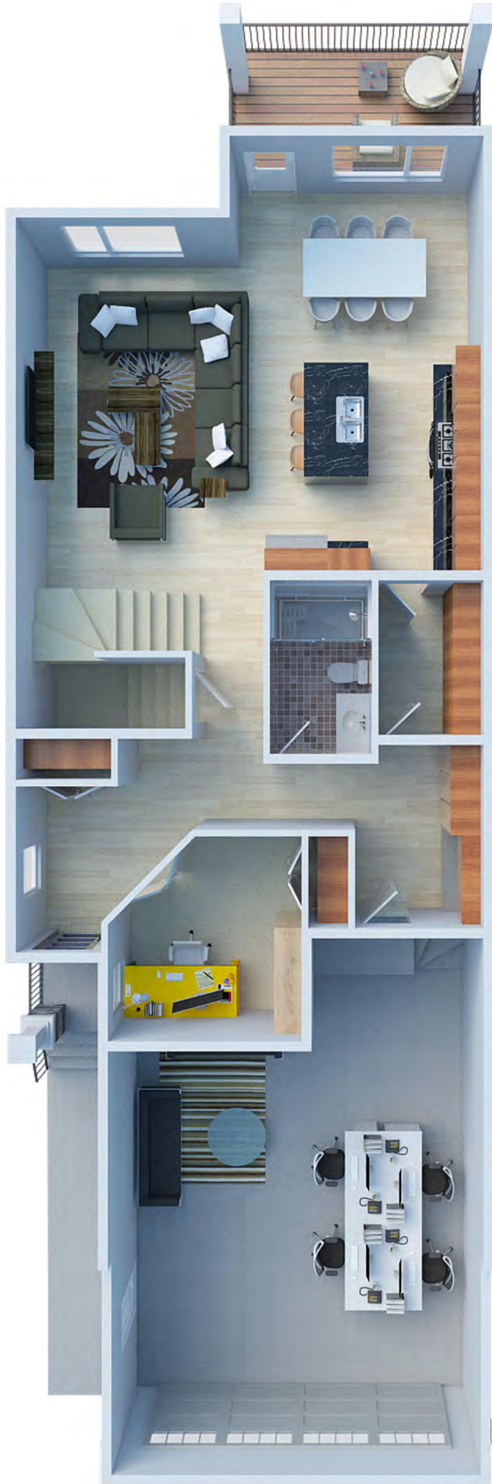
MAIN FLOOR 981 SQ. FT.