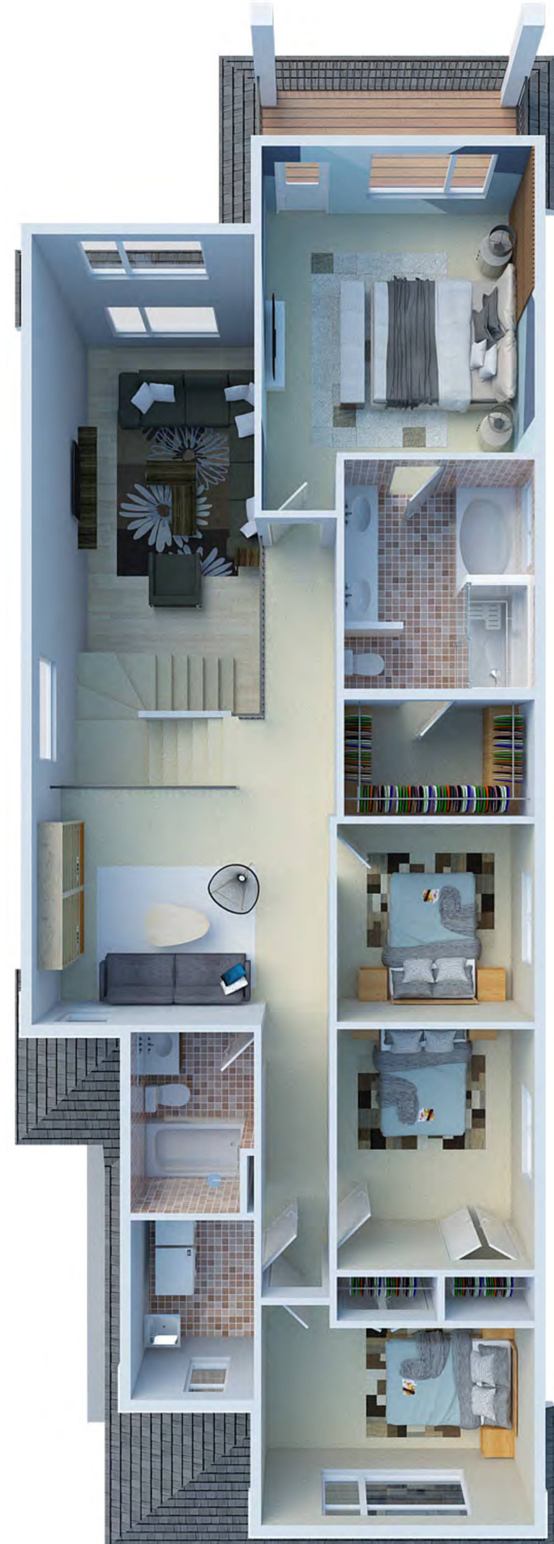
UPPER FLOOR 1087 SQ. FT.