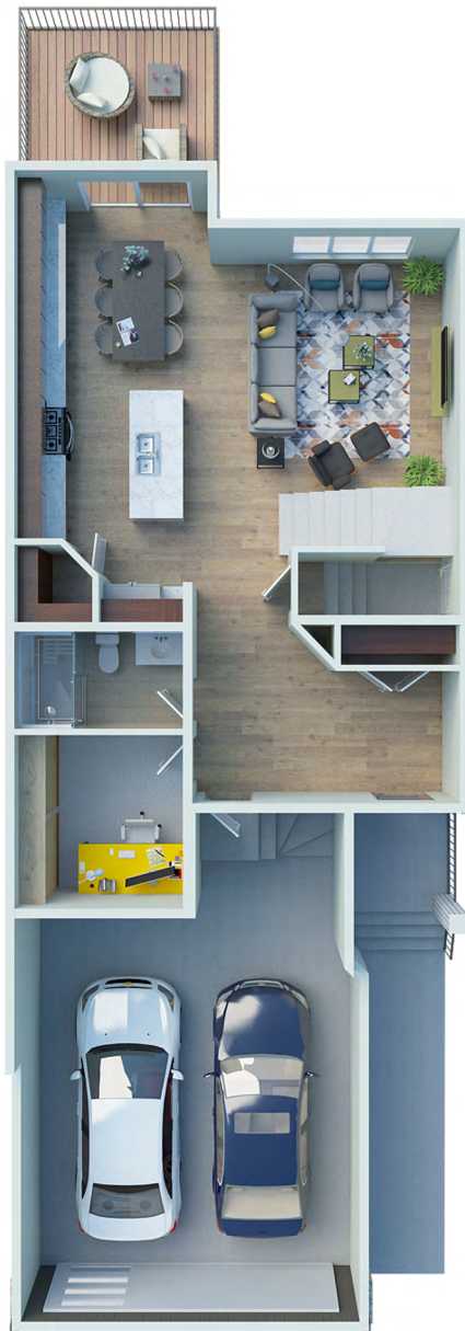
MAIN FLOOR 823 SQ. FT.