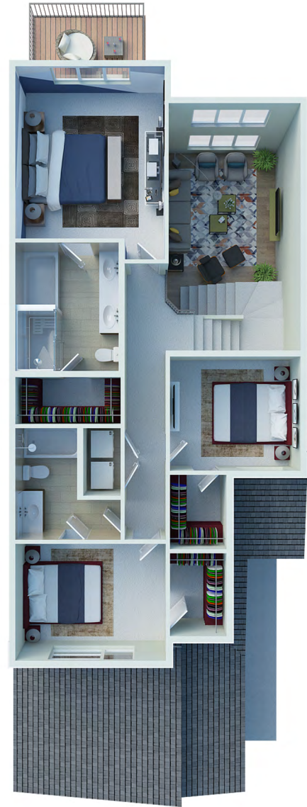
UPPER FLOOR 825 SQ. FT.