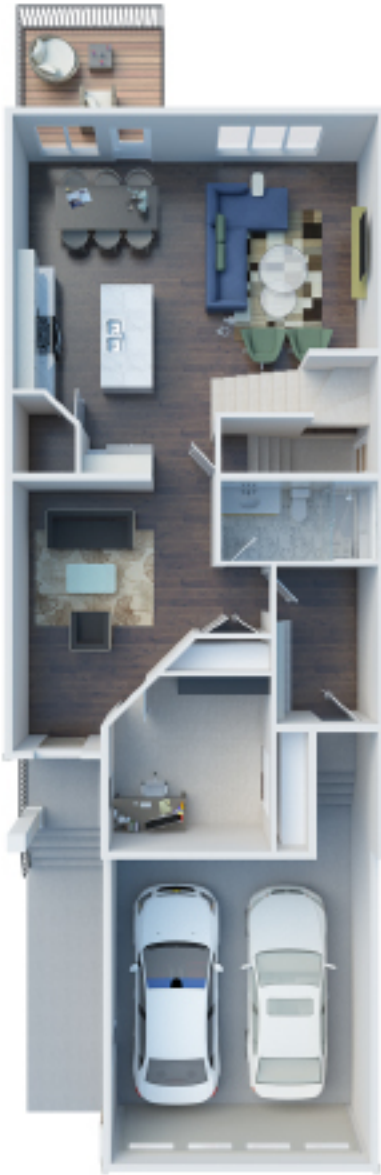
MAIN FLOOR 1064 SQ. FT.