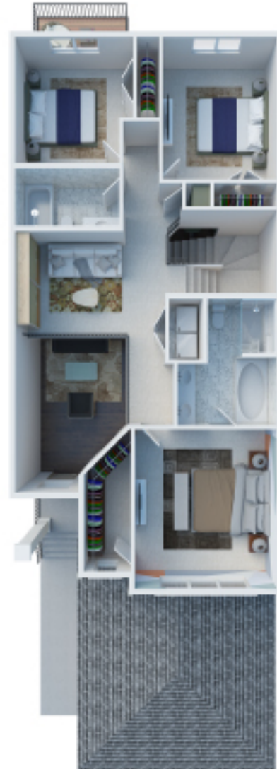
UPPER FLOOR 936 SQ. FT.